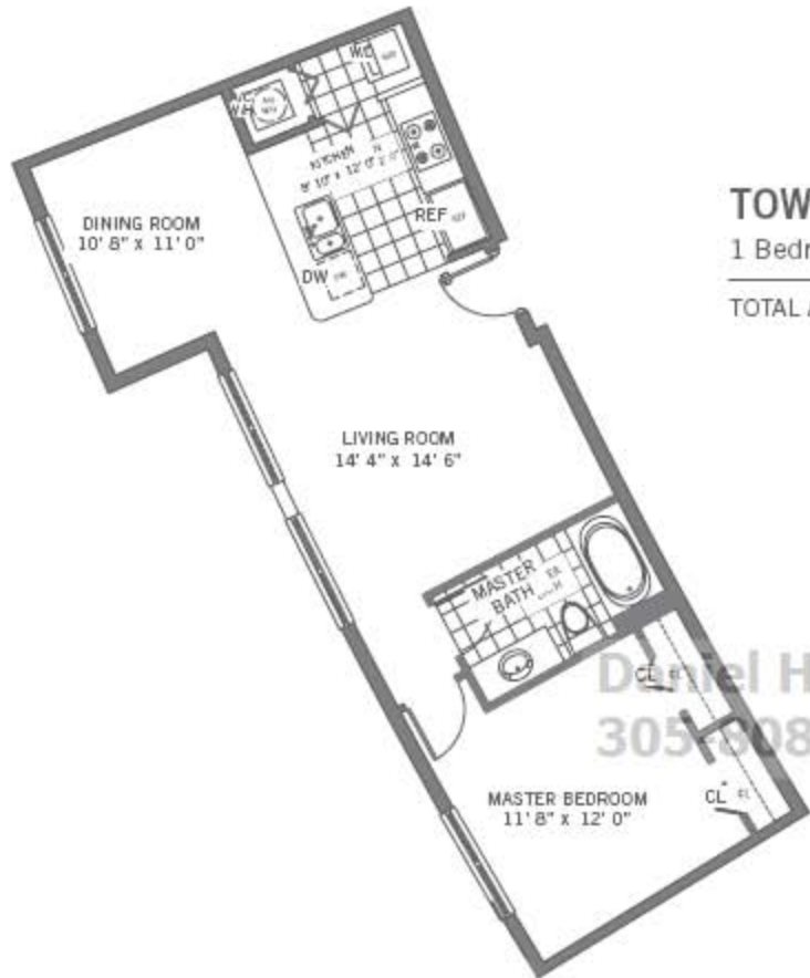
TOWNHOUSE F1 1 Bedroom | 1 Bathroom TOTAL AREA 750 S.F.